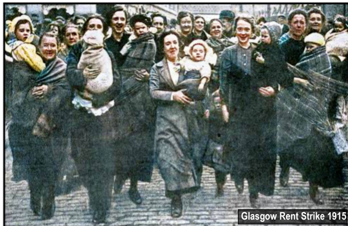
Glasgow Rent Strike 1915

HOUSING ACTION ★ ANTI-WAR ANTI-RACIST ★ UNION ACTION