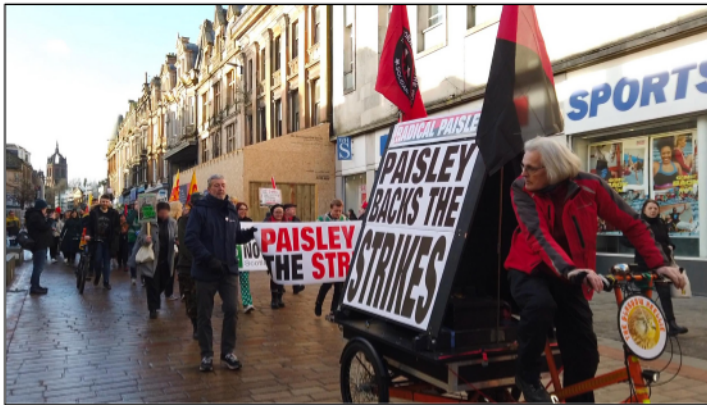
• The Keelie Rickshaw on tour, supporting Paisley Strike Solidarity on their demo. Strike Solidarity groups also exist in Glasgow North, South, East and West. Check them out on social media.