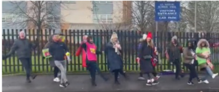
• Pickets at All Saints Secondary keep warm by dancing The Sloss

Except, the alternative to the Tories doesn't look particularly promising at the moment. with Keir Starmer's Labour party