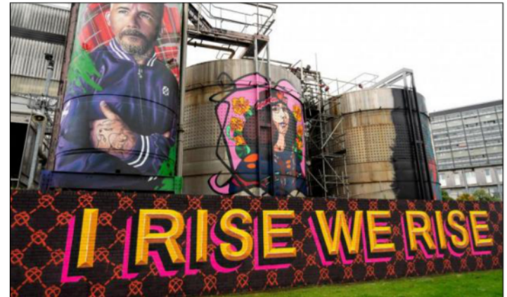
Mural at Strathclyde Distillery, opposite Glasgow Green. I Rise, We Rise: UNIONISE!