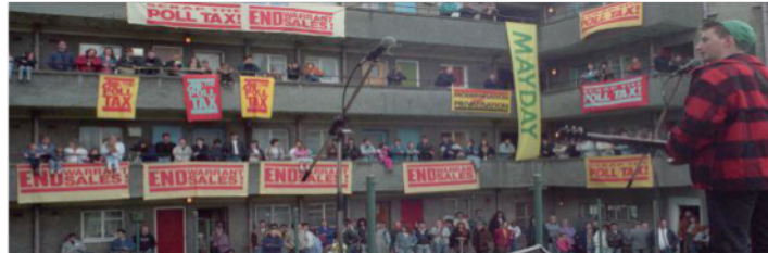
• BACK IN THE DAY: CRANHILL RALLY.

While we do win things by the efforts of many, most of our wins are to do with cultural change in making peoples lives a bit better. Which we need. But the other change we need is to change the institutions that work to undo and roll back any progress we will make. The banks, the corporations, the faceless and ubiquitous private equity firms, the off-shore interest companies, the corruption in governments.