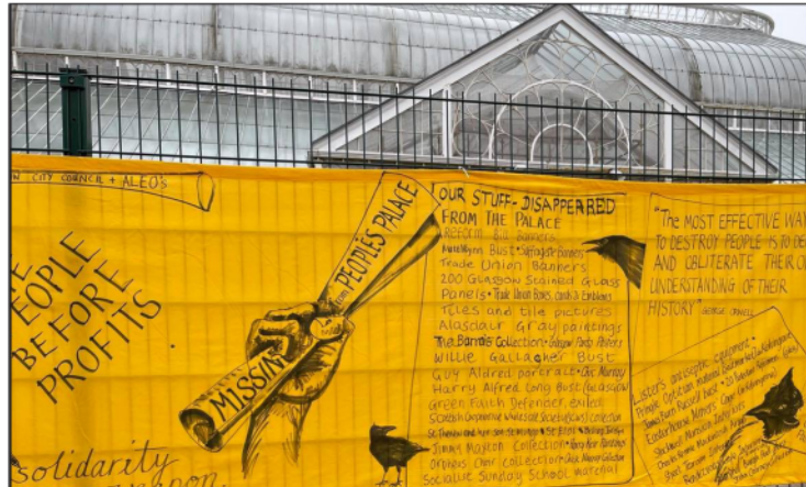
• PART OF THE MASSIVE PROTEST BANNER that will be wrapped around the Security Fence that seals the Winter Gardens off from the public. It will be on display at the COP26 Demo at Glasgow Green on Saturday 6th November. Check it out!