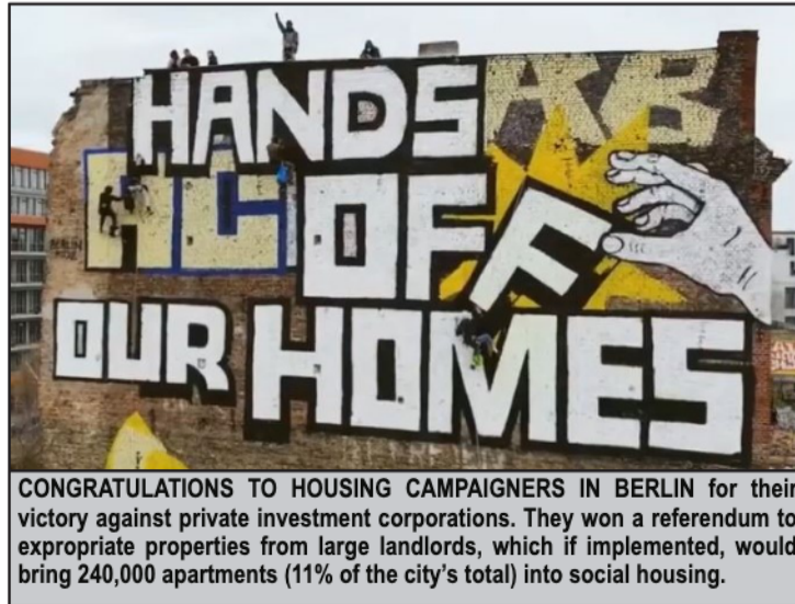
CONGRATULATIONS TO HOUSING CAMPAIGNERS IN BERLIN for their victory against private investment corporations. They won a referendum to expropriate properties from large landlords, which if implemented, would bring 240,000 apartments (11% of the city's total) into social housing.

These, and many other actions worldwide go on every week. We call it International Solidarity but what does it mean? People who read about the plight of fellow workers, go from empathy, concern and anger to action. They want to bring it to the attention of those who shop, unwittingly, mainly, at stores like Primark , or as in 2020 with Bangladesh garment workers, at Lidl .