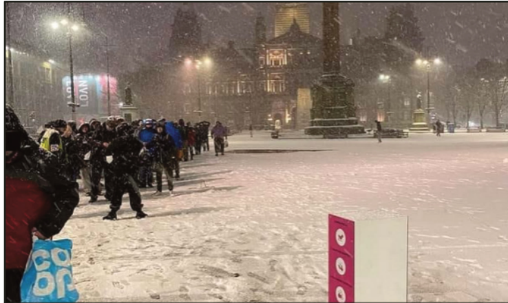
THE SCENE THAT SHOCKED THE CITY: Soup Kitchen ran by Kindness Homeless Street team in February 21