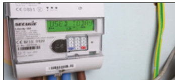
Smart Meters: A Judas in the House?

And today, this is precisely what smart meters can do. They allow energy companies to switch people onto a pre-payment system remotely and immediately. By contrast, if you're on an ordinary meter, being switched to a prepayment meter is a costly and timely process: the prepayment meter needs to be manually installed, which can take weeks and requires specialist skills.