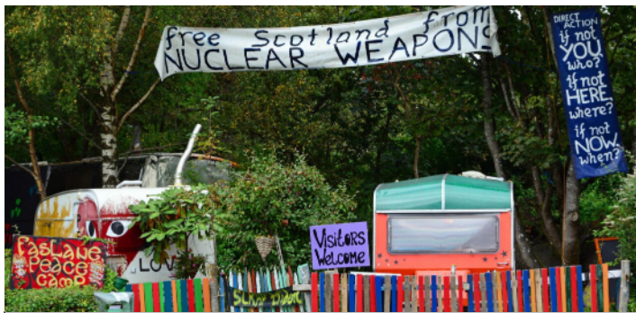
• For 40 years Faslane Peace Camp has stood against the obscenity of Nuclear War