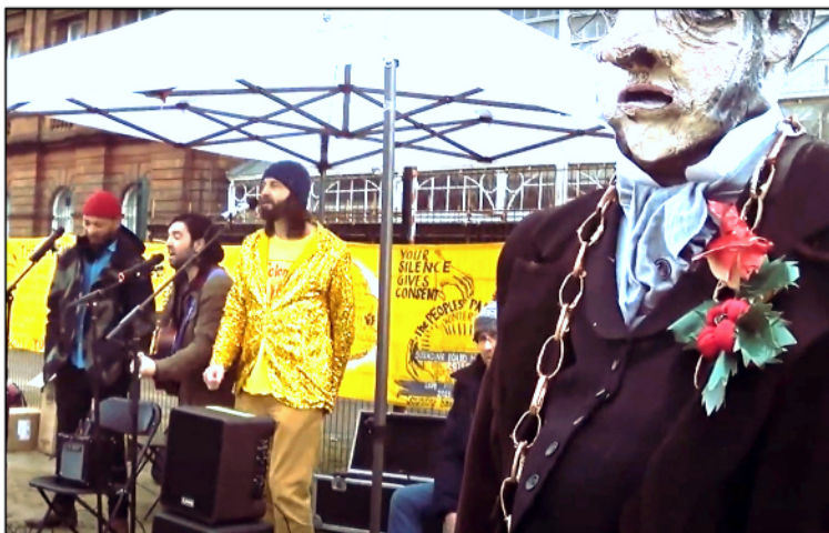
• COLONEL MUSTARD AND THE DIJON 5, just one of the many fine acts who performed on the Green in support of the campaign to save the People's Palace and Winter Gardens

The ribbon documents some of the soul-destroying processes we have gone through with GCC and with Glasgow Life over the past three years and is covered in representations expressing our anger at their reluctance to engage with us to repair and reopen both the