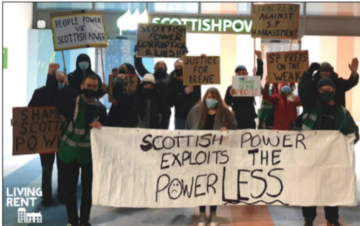
Glasgow tenants stand up to ScottishPower's harassment and fake debts! Living Rent members attended Scottish Power headquarters to demand the company clears a fake debt of over £1,500 and ends all harassment through debt collection agencies. Read the full story at https://www.facebook.com/LivingRentGlasgow

But the friendly Daily Record is owned by REACH plc one of Britain's biggest newspaper groups. Beware product placement and advertorials – oorheid's urnae buttoned up the back! 'Sponsored' columns should be clearly indicated yet their stay-warm advice passively cloaks a large Electrical Company which advises