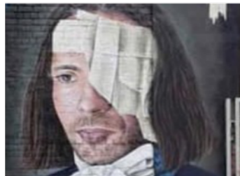
• A NEW MURAL of Thomas Muir in the City Centre by Rogue One

However, George Washington heard of his sentence and sent the USS Otter to rescue him and take him to the new Republic of America. His escape was made good in 1796, however the USS Otter, on its way home was wrecked off Panama. Thomas Muir was then arrested by the Spanish and taken to Havana where he was deemed to be a spy and