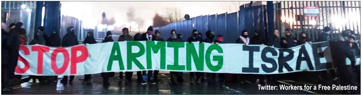
Twitter: Workers for a Free Palestine

• In February, over 100 people blockaded BAE Systems in Govan, part of the chain of Arms suppliers to Israel