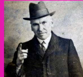
• John Maclean, Clydeside Revolutionary, Speech from the Dock, 1918

NO GOVERNMENT is going to take from me MY RIGHT TO SPEAK, MY RIGHT TO PROTEST against wrong, my right to do everything that is for the benefit of mankind.