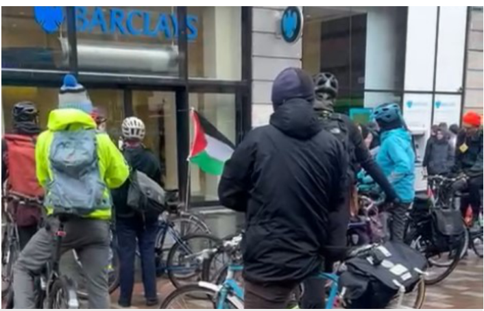
BIG RIDE FOR PALESTINE CYCLISTS stopped off at Barclays Bank in Argyle Street to protest at its bankrolling of Israel's genocidal attack on Palestinians.

Barclays remains complicit with Israel's apartheid system. The bank faced a similar boycott campaign over its financial support for South African apartheid before eventually being forced to divest in 1986.